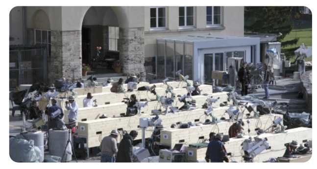
The International Pyrheliometer Comparison

The absolute cavity radiometer is electrically self-calibrating. This works as follows; solar radiation is absorbed inside a blackened cavity, which results in a voltage output from a thermopile similar to a pyrheliometer. Next, a shutter is closed and the sunlight is blocked. Now, the solar power is replaced by electrical power to maintain the thermopile voltage. If the dissipated electrical power (Watts) and the area of the aperture of the cavity radiometer (m²) are accurately known, the instrument can be calibrated. One of the few things that can cause a drift over time is the absorption coefficient of the black paint of the cavity.