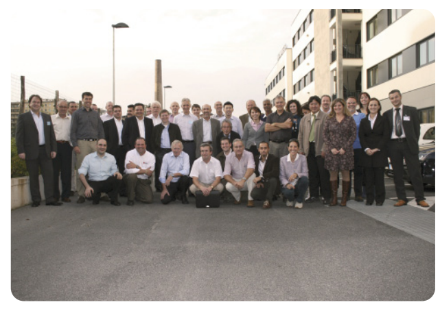
Our representatives at the International Sales Meeting in Rome

The new format during the International Sales Meeting in Rome was a great success which we hope to continue at our next meeting, in the Asia-Pacific region in this year!