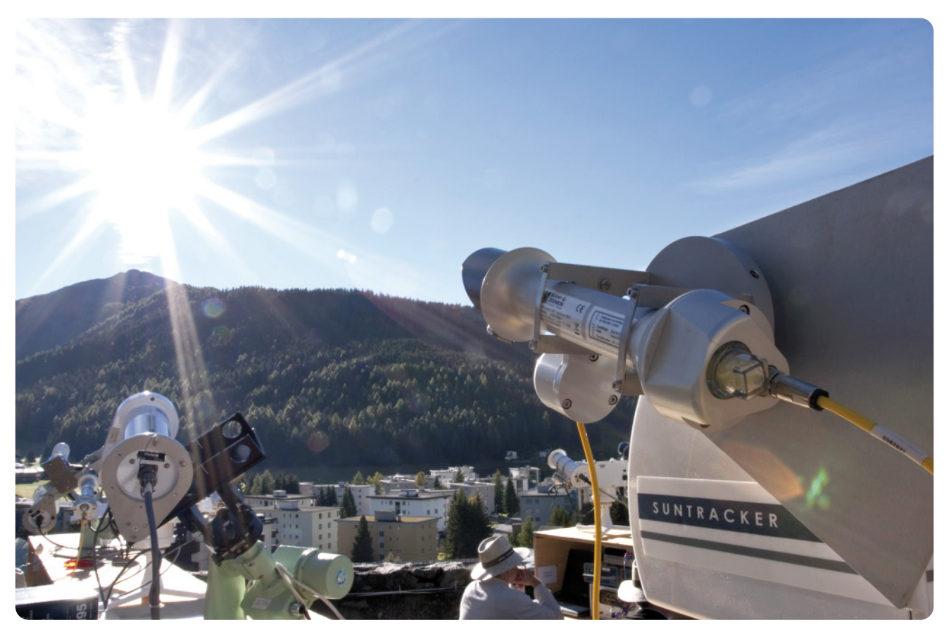
Our CHP 1 Pyrheliometer directed to the sun in Davos

The International Pyrheliometer Comparison (IPC) is a event that takes place every 5 years where specialists working in the field of solar radiation measurements come to Davos in Switzerland to compare their reference instruments to the World Standard Group (WSG).