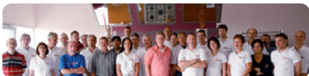
Group picture of the headquarters team

It was difficult to decide on the winning team. However, the disqualification of Team 2 made the decision easier. Team 2 thought they were smart by using modern technology (the mobile internet) to consult food websites for the questionnaire, but this was judged to be an unfair advantage! In the end Team 1 was awarded the prize, but after a great day of fun, and a full stomach, everyone felt like a winner ■