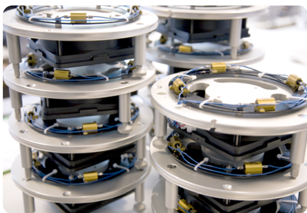
Components of the CVF 3 ready for production

The new CVF 3 features the waterproof connector and signature yellow cable that are used in our other instruments. This makes installation and servicing easier. Cable lengths of 10, 25 and 50 m are available or it can be supplied with the connector plug only, for the customer to fit their own cable. A further improvement is a 'tacho' output from the ventilator fan. This output gives two pulses per revolution and allows remote monitoring of the ventilator fan operation using a data logger.