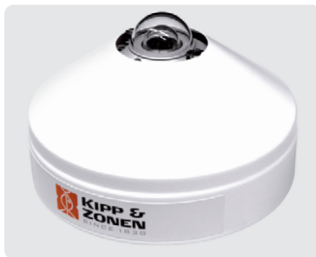
The new ventilation unit CVF 3

The ventilator of the CVF 3 runs continuously and two levels of heating are available that can be switched on by the operator when required. 5 Watt heating is used under normal conditions and 10 Watt heating in more extreme climates. The integrated heater warms the air flow to help prevent precipitation of snow and frost and stabilises the dome temperature about 1° above ambient. CVF 3 is designed to operate under all weather conditions and is easy to use. The only part that needs maintenance is the removable air inlet filter, which should be checked at regular intervals. A ventilation system does not prevent the dome becoming dirty, but it can reduce the frequency of cleaning.