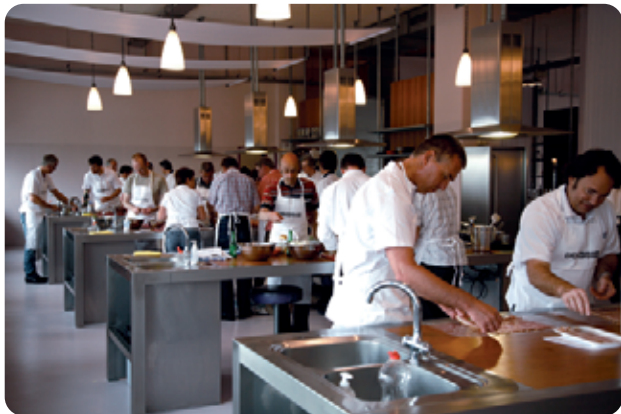
Enthusiastic teamwork at the “Kookfabriek”

An old American school bus took the whole crew to a secret venue called the “Kookfabriek” (Dutch for cooking factory). At the Kookfabriek we split into 3 teams that were faced with the challenges of cooking a four-course menu. Each team member was appointed to one of the four courses; a profiterole of truffle cream and goat cheese, Norwegian salmon with a salad of wild spinach, a roulade of lamb and bacon with ratatouille, and a desert of banana pastry with frangipane and sabayon of almond. Each team also completed a questionnaire to display their knowledge of cookery.