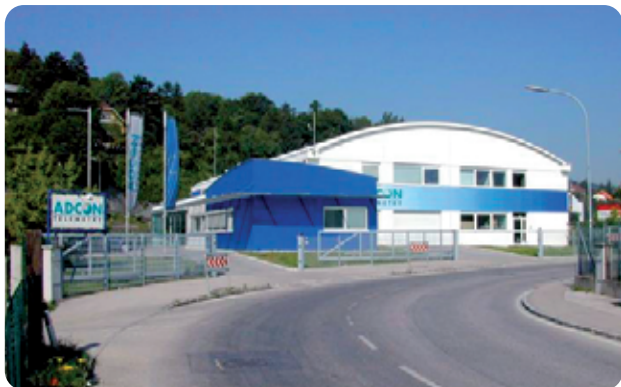
Headquarters of Adcon, Klosterneuburg, Austria

Kipp & Zonen has partnerships with leading manufacturers of Automatic Weather Stations (AWS) and monitoring systems for meteorology, hydrology and agriculture. Measurement of solar radiation is now becoming a standard parameter in these applications and when high quality, reliable and consistent sensors are required, companies turn to Kipp & Zonen. For example, Kipp & Zonen is the preferred supplier of solar radiation sensors to Adcon Telemetry GmbH of Klosterneuburg in Austria.